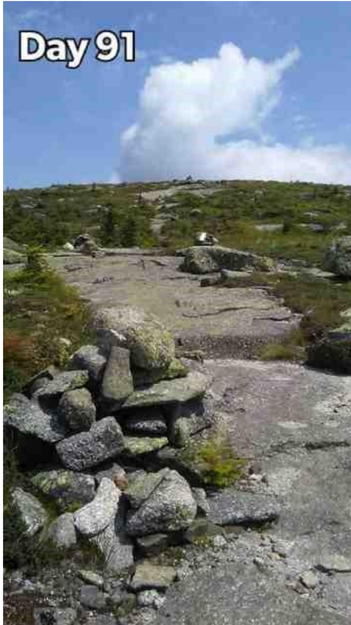
Photo: Day 91 Das is Sadelback Mountain as seen in sun ☀ A beautiful mountain with great scenic views! I have him...(2017-07-22 20:55)

Thank you! I would also like a little less rain, more dry weather! ☀