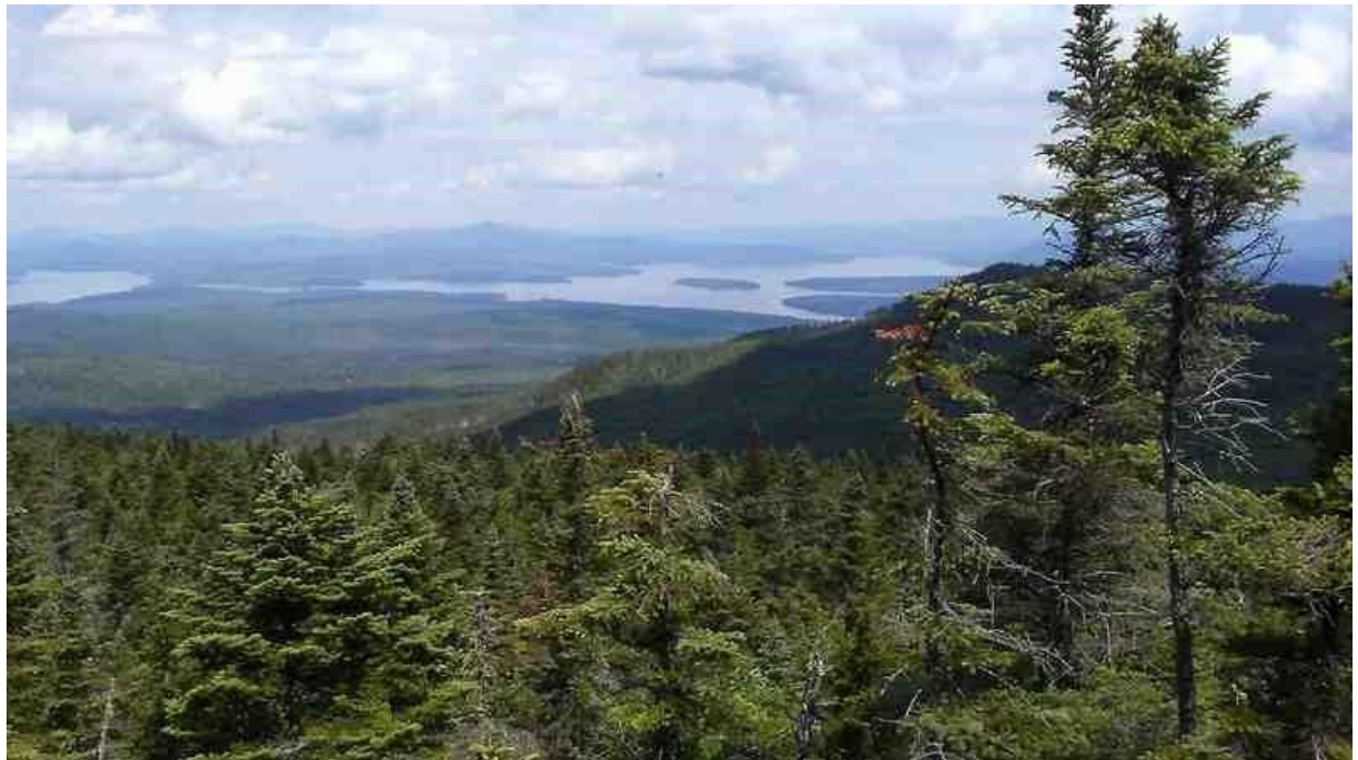
Photo: Day 89-90 Li o: The lake in Rangeley, where I now spend my Nearo darf.Re o: Top of Bemis MountainMi e: Sabbath Day ... (2017-07-19 22:19)

Dear people, my phone does not work. Research will take a while, so I can only communicate via blog or email and only if there is WiFi. Up here so not so ...