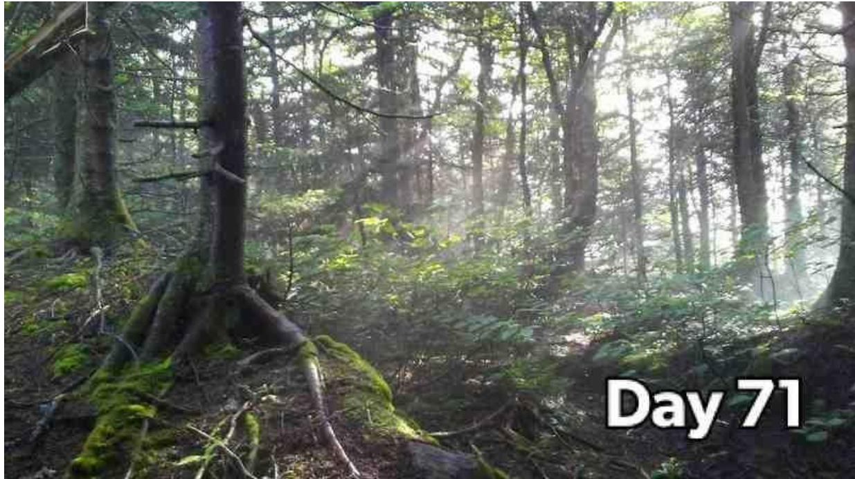
Photo: Day 71 Der day was Vibrations ernd, hard and a lesson The trails are really crude and after es mi ags again started ...! (2017-07-02 22:09)