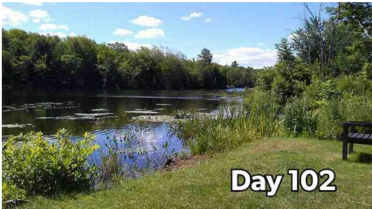
Photo: Day 102 Sun, Nominal erschauer, canoeing, swimming, lying in the sun and eat naturally. That's the hay ge Zero ...(2017-07-31 21:36)