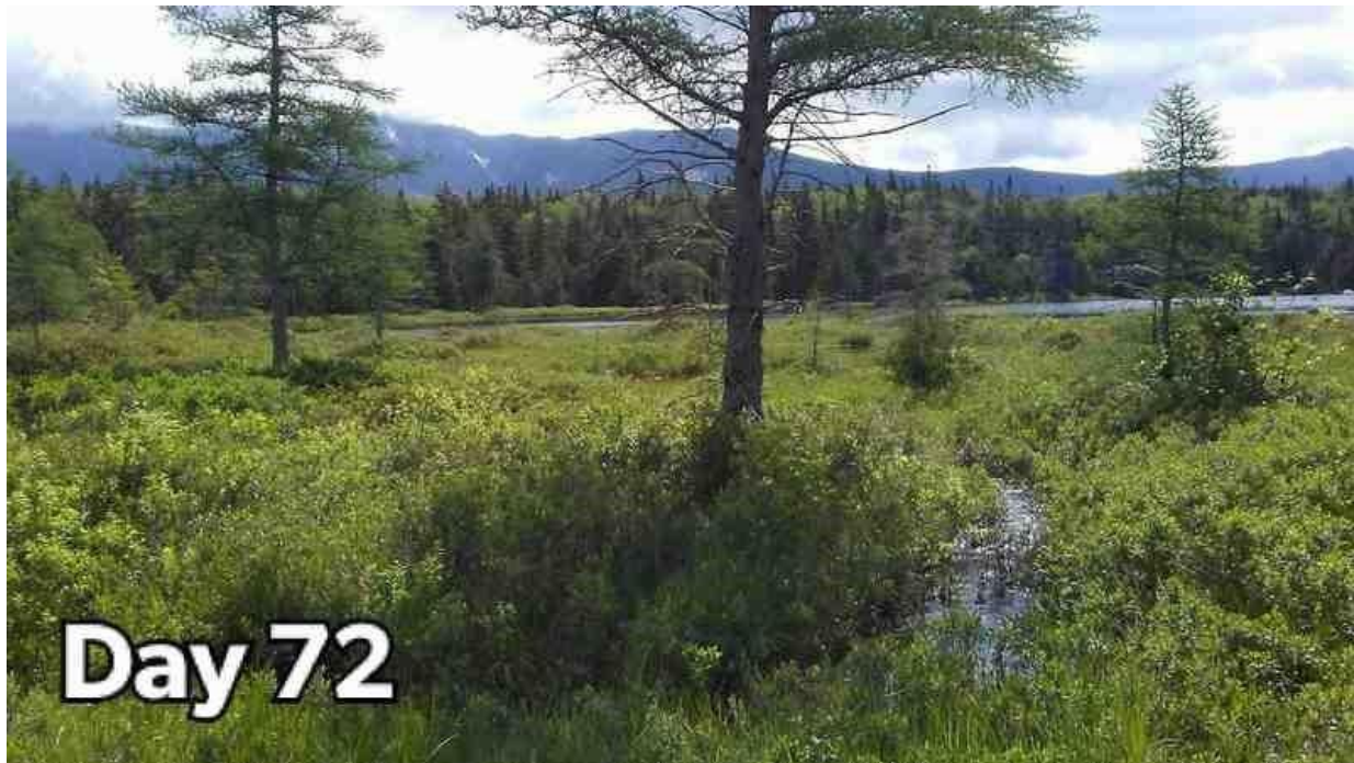
Photo: Day 72 Wenn the sun shines, it can rich g be beautiful! I had to today because of high water and flooding a diversion ...(2017-07-03 20:31)