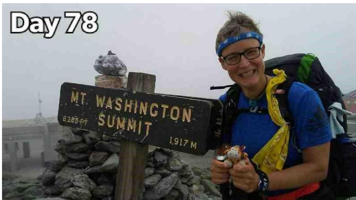
Photo: Day 78 Trotz many clouds we have come across Mt. Washington today. The highest point of northern Häl s what AT. Of the... (2017-07-08 13:17)