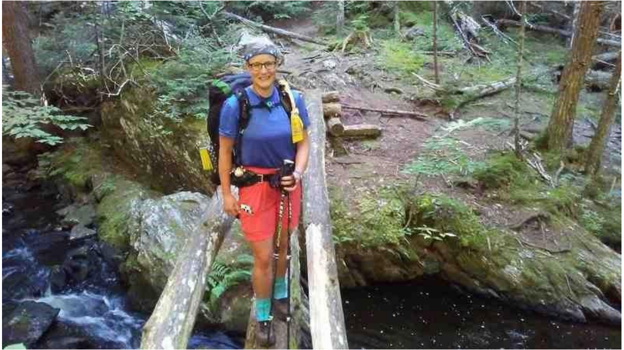
Photo: Day97 EineabenteuerlicheBrückeundeinFotovondemne enbach have denwireineWeilebegleitet. (2017-07-29 16:00)