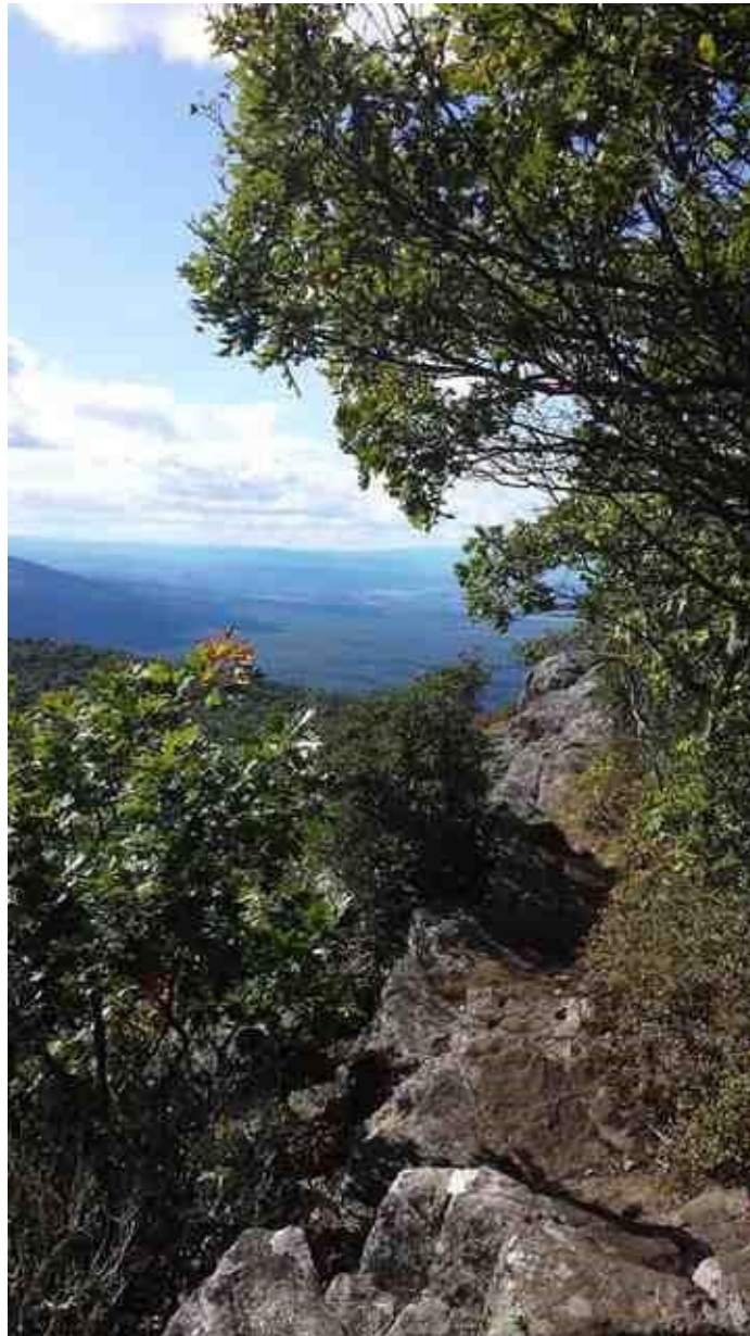
Photo: Day 140 Wir are straight on because of the beautiful We ers the next day. Humpback Mountain would be overcome. The picture...(2017-09-13 00:27)