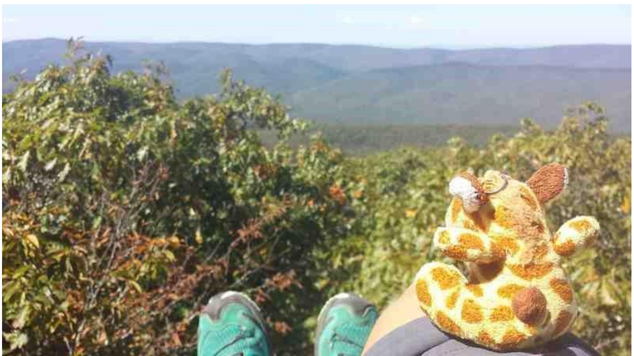
Photo: Day 15 6Heute we were only in the green tunnel, up to a prospect that enjoyed Frodo hat.Li u: so looks nicer ... (2017-09-24 21:07)

There were dozens of butterflies in the fields today, but I only caught the little, shy, blue one. The brown one was quite tall and not as well camouflaged as he thought ...