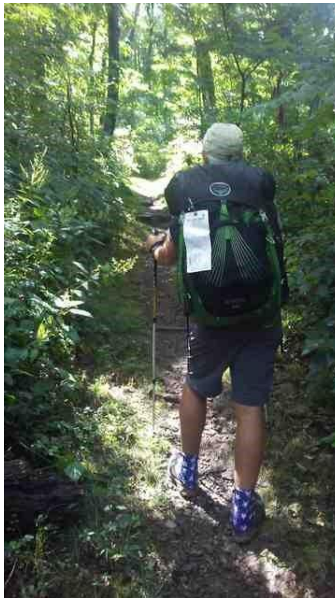
Photo: Day 132 Wir hiken in Shenandoah National Park. obediently on carrying our permit to the backpack and we now have so chic ...(2017-09-07 08:30)

Unfortunately, I do not have a good network, but I hope for tomorrow (if we are in the rain to Waynesboro, VA) or better the day after tomorrow (Zeroday), that there is WiFi in the hostel. Then there are pictures again!