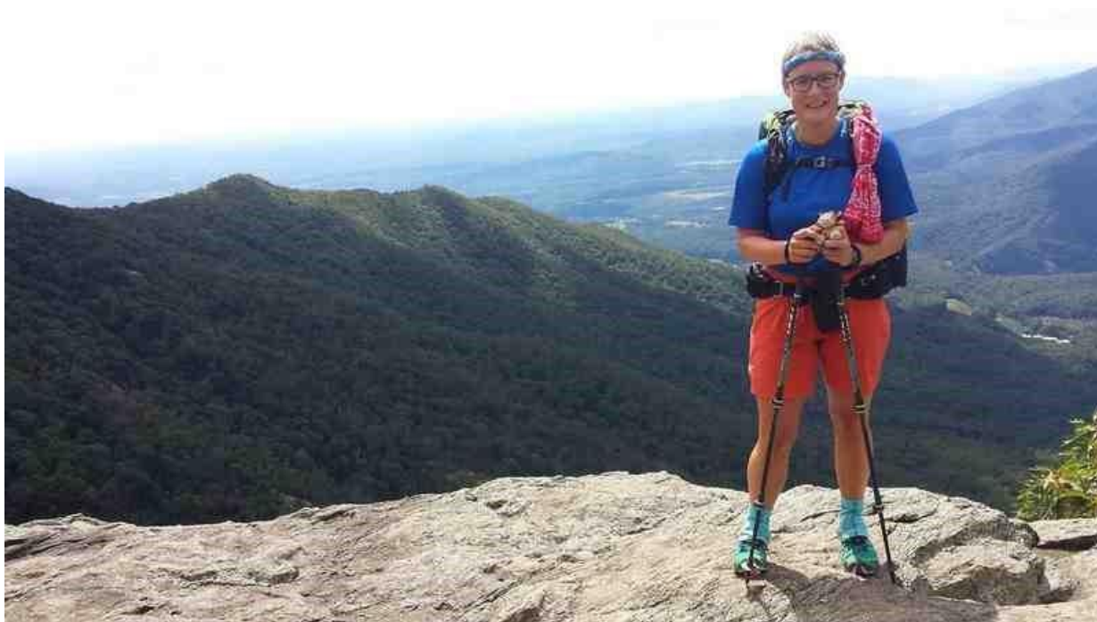
Photo: Day 141 Ein Another cool, sunny day. Virginia continues to offer super beautiful trails with Serpen nen 1a and neat ...(2017-09-13 00:39)

U: Happy Feet at the everyday Zeltau au.