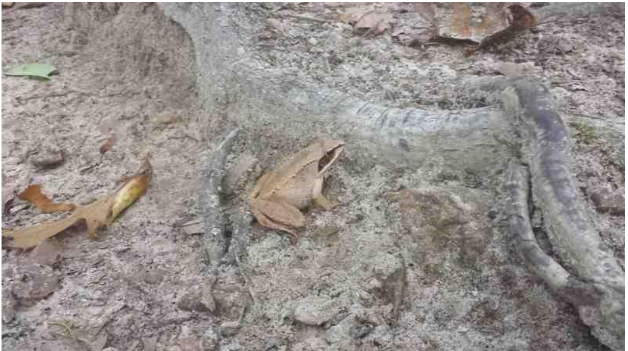
Photo: Day 153 Wir have only just coping with water scarcity, but the frog looked quite fit off.The turtle has actually ... (2017-09-20 20:08)