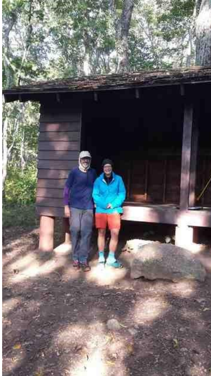
Photo: Day 143 Nach an ass cold night we went back the next morning at temperatures below 5 degrees more over many hills, the top ... (2017-09-13 01:00)

Wildlife: we hear occasional owls and, more recently, coyotes, but mostly only the little animals can be seen. (That's okay too!)