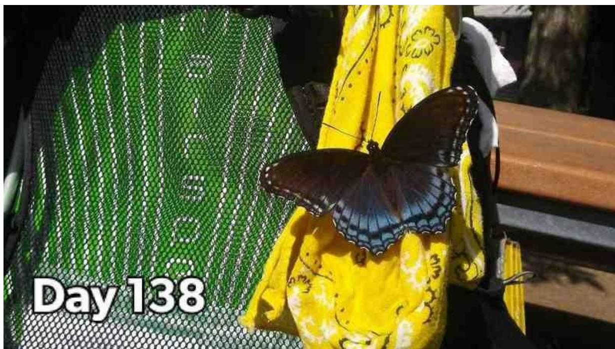
Photo: Day 138 Wir yesterday in the rain, not in the drizzle! That's a difference! our 7 Miles gehikt to Waynesboro .... (2017-09-07 09:52)

Photo: Day 133-137Ihr need me the gathering forgive, but I can not transfer all the photos on the new smartphone and let the ... (2017-09-07 09:32)