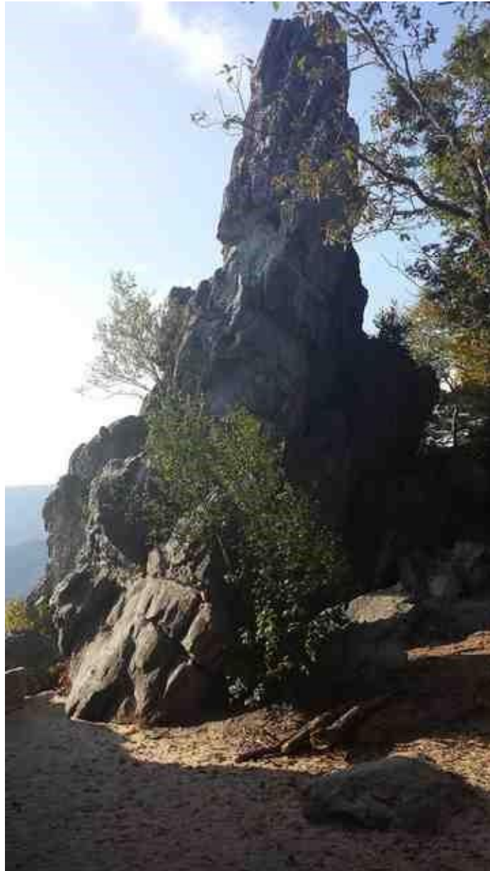
Photo: Day 154Links Dragons Tooth, right single wildlife today. (2017-09-24 20:50)