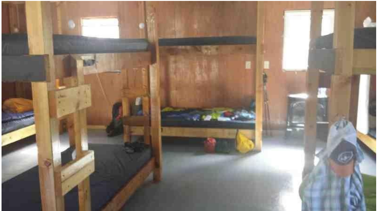
Photo: Day 159 Angel's Rest Hiker Hostel Li o: our bunk room. The Bunkbed in the e mi with many stuff it's mine. Re...(2017-09-26 14:16)

The daylight is getting less and less. At 19:15 clock it gets dark and at 6:30 clock again bright. My body finds the long time in the tent great, I usually sleep 10 hours. I need them right now!