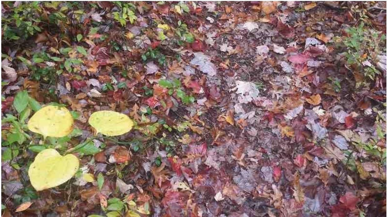
Photo: Day 179 Heute night it rained and the temperature has fallen sharply. It was pretty fresh today and the scarce 10 ...(2017-10-16 20:45)

So, after a lazy, because rainy tomorrow, I will now slowly open for a relatively short day