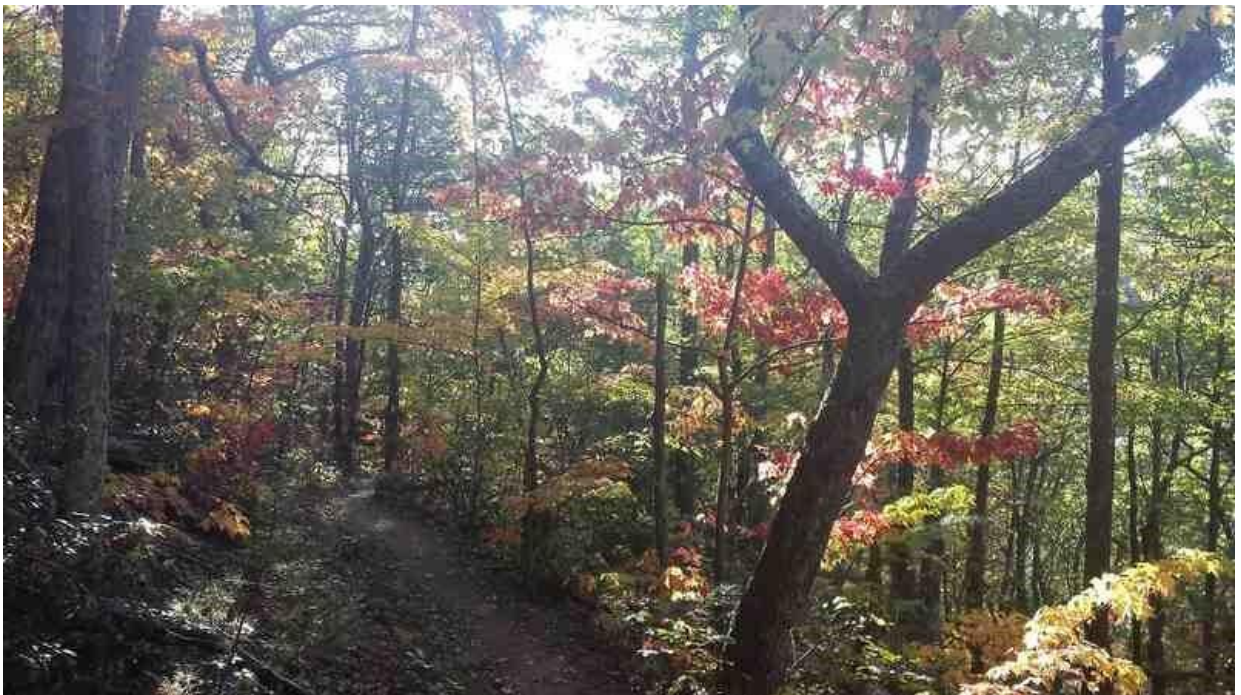
Photo: Day 169 Es is unmistakable fall! The foliage is colorful and it's after weeks without rain almost all dried up. (Re: a ...(2017-10-12 17:45)

The only exciting thing today was the drop source, where we spent an hour tapping our water for the night ...