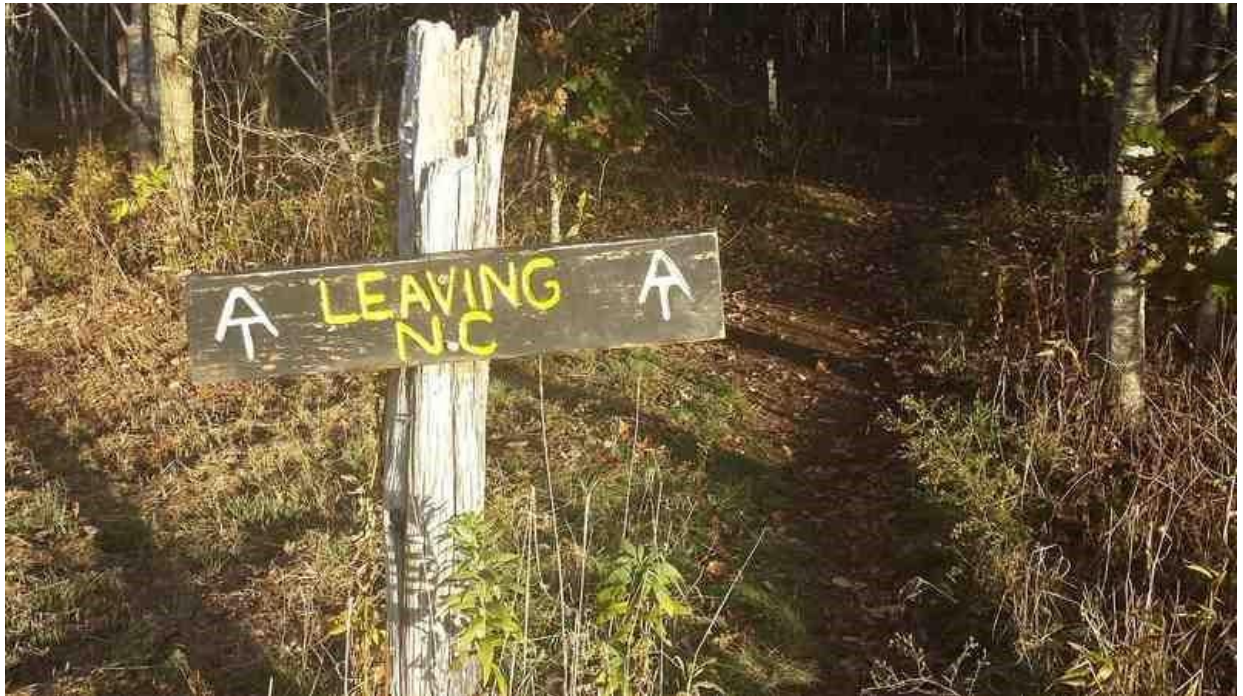
Photo: Day 182 Soooo beautiful! Honestly, I think it's lovely here! Good hiking trails and the Roan Highlands are perhaps ...(2017-10-23 11:14)