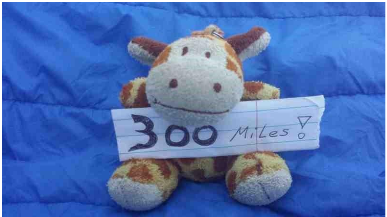
Photo: Day 190 Frodo sat this morning with the little reminder on my sleeping bag, so that we can not forget the 300 ... (2017-10-29 18:00)

Now I have to leave the city tomorrow, my budget is finished!