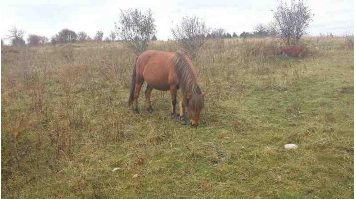
Photo: Day 173 Today we the ponies in the morning at eight still all to ourselves. Longhorns there was also a pony and has ...(2017-10-12 18:40)