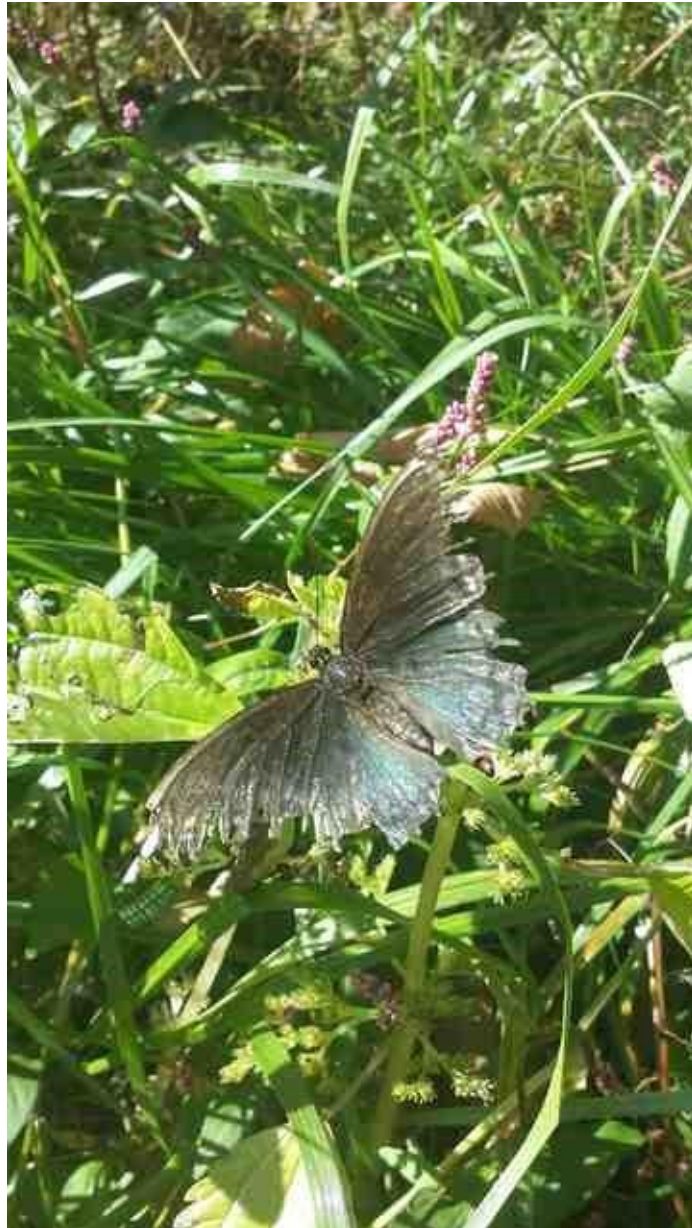
Photo: Day 181Es was a beautiful day with super nice trail and even wildlife. The Go esanbeterin was at the hostel to the ...(2017-10-23 11:03)