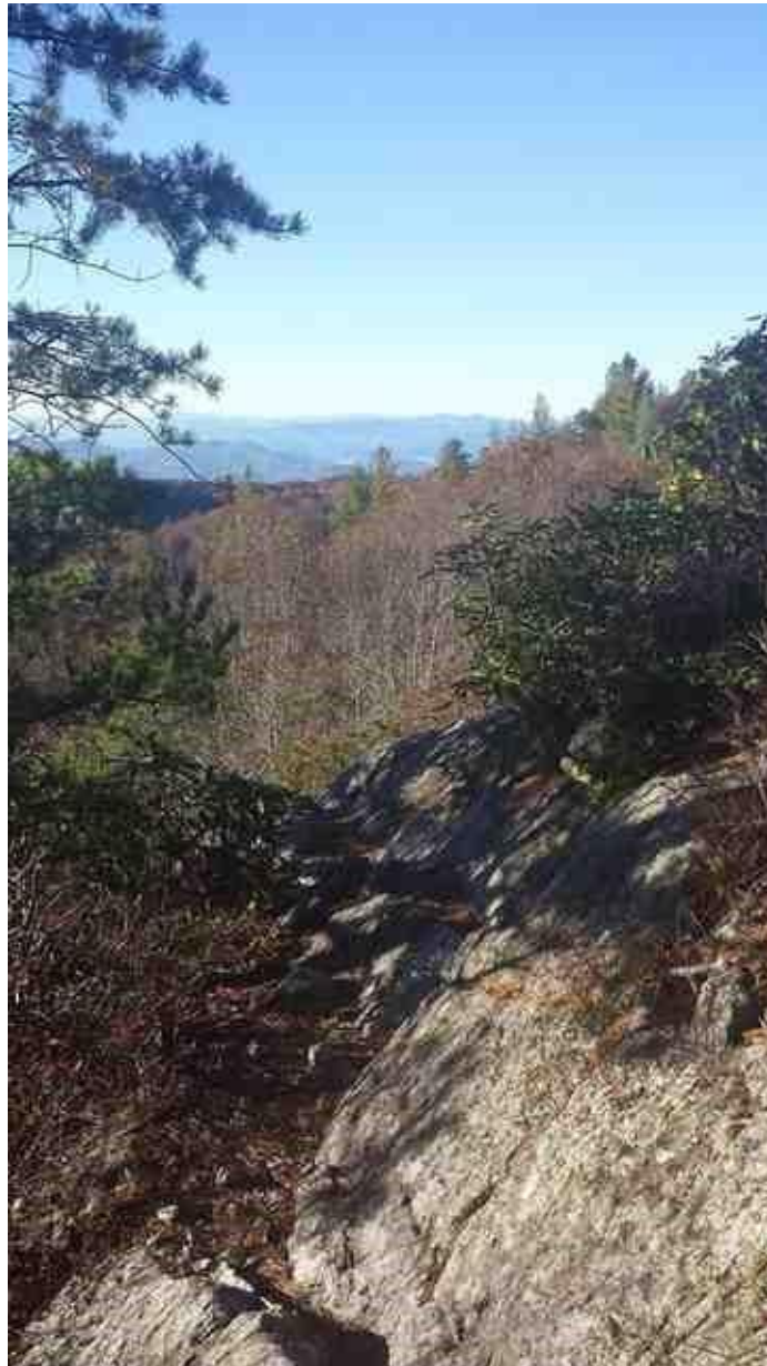
Photo: Day 190 Das was the rocky path with great views. Such things can not photograph well you, because you have to ...(2017-10-29 20:52)