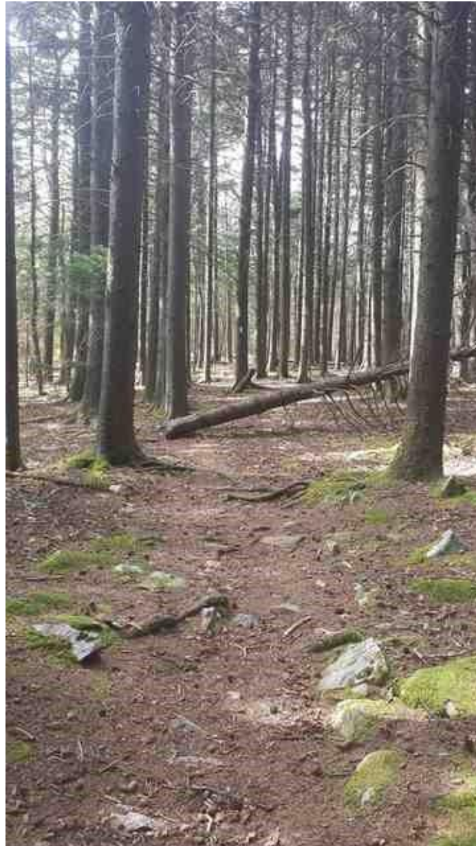
Photo: Day ??? I just lost a little bit of an overview. However briefly from the top of Unaka Mountain: Frodo and I feel ... (2017-10-21 17:01)

I am already looking forward to it and Frodo turned red when I abducted him from you. Sometimes I think that maybe he's a sensitive animal somewhere in there ...