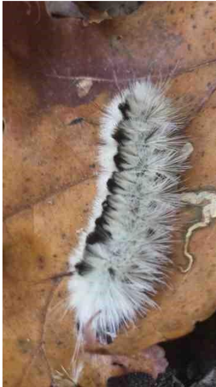
Photo: Day 167 Der brother of Wolly Bear yesterday But I do have a feeling that the animals prepare for winter slowly ... (2017-10-04 19:31)

This morning it was again less than 5 degrees (brrr!) But we could indeed start from a warm Be, so it was not so tragic. In the great sunshine without wind, it is then even become rich g hot