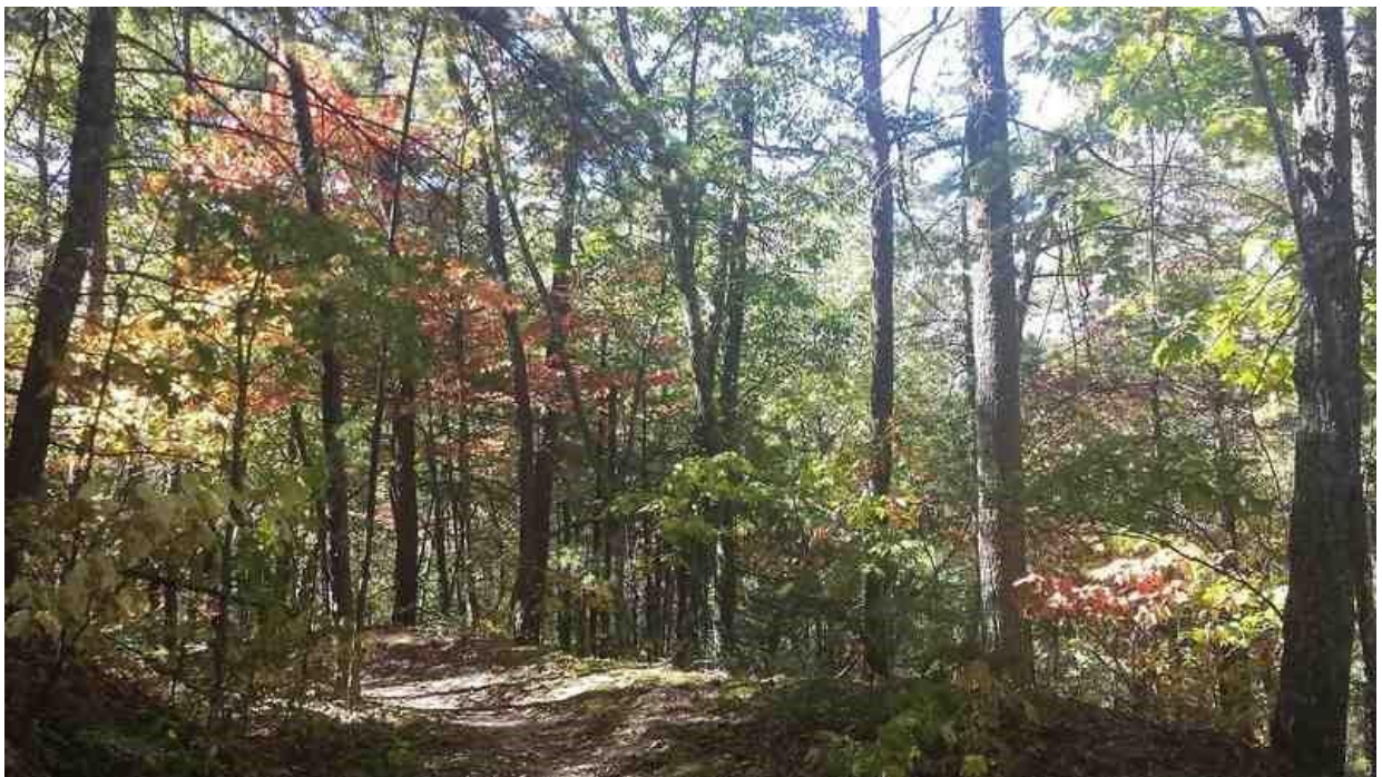
Photo: Day 163 17.7 miles because of the water situa on. Thanks to the great trails and the rela v harmless elevation profile, we have ...(2017-10-03 21:12)