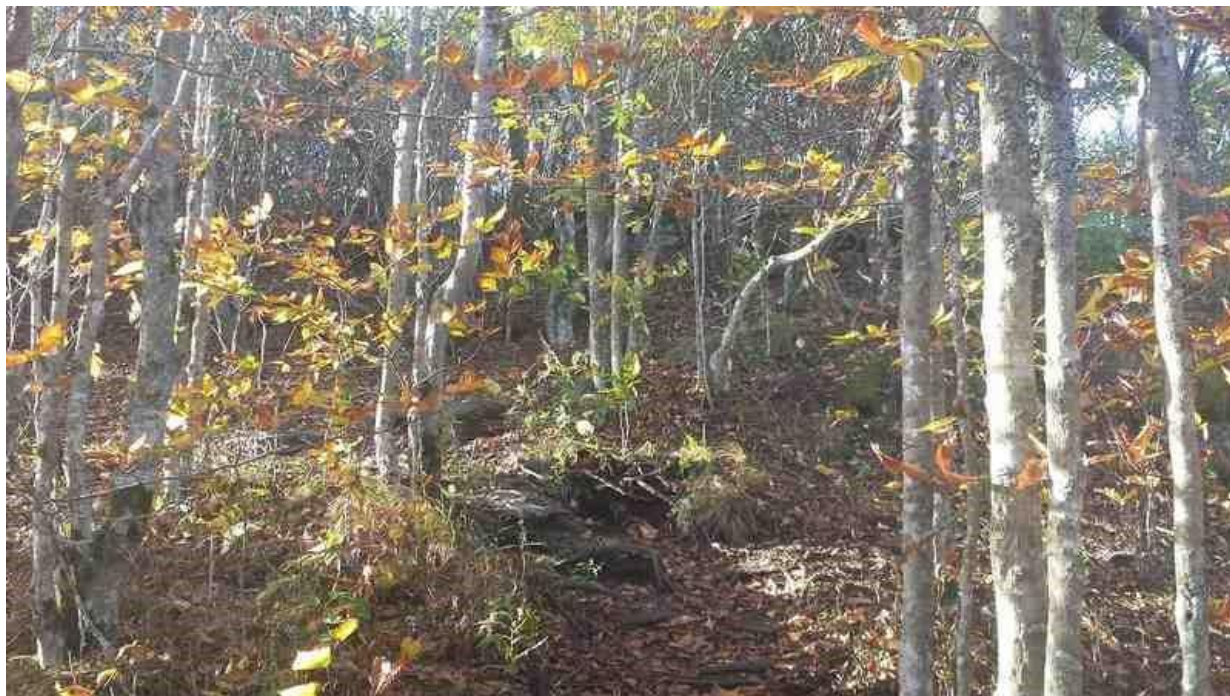
Photo: Day 183 Wir are back "in the woods" back in the woods. It went up and down, up and down and all day .The ... (2017-10-23 12:00)