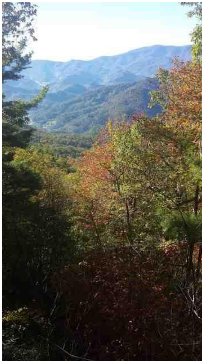
Photo: Day 180Das is just my view. So beautiful! 've almost forgotten that 3 hours ago it was still freezing cold Opposite ... (2017-10-17 11:55)