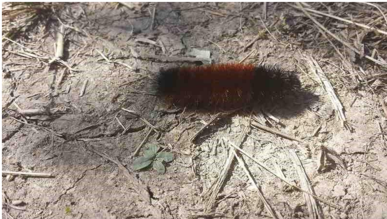
Photo: Day 166 Wildlife! A wooly bear. Do not ask me what that kind of thing is....(2017-10-03 22:29)