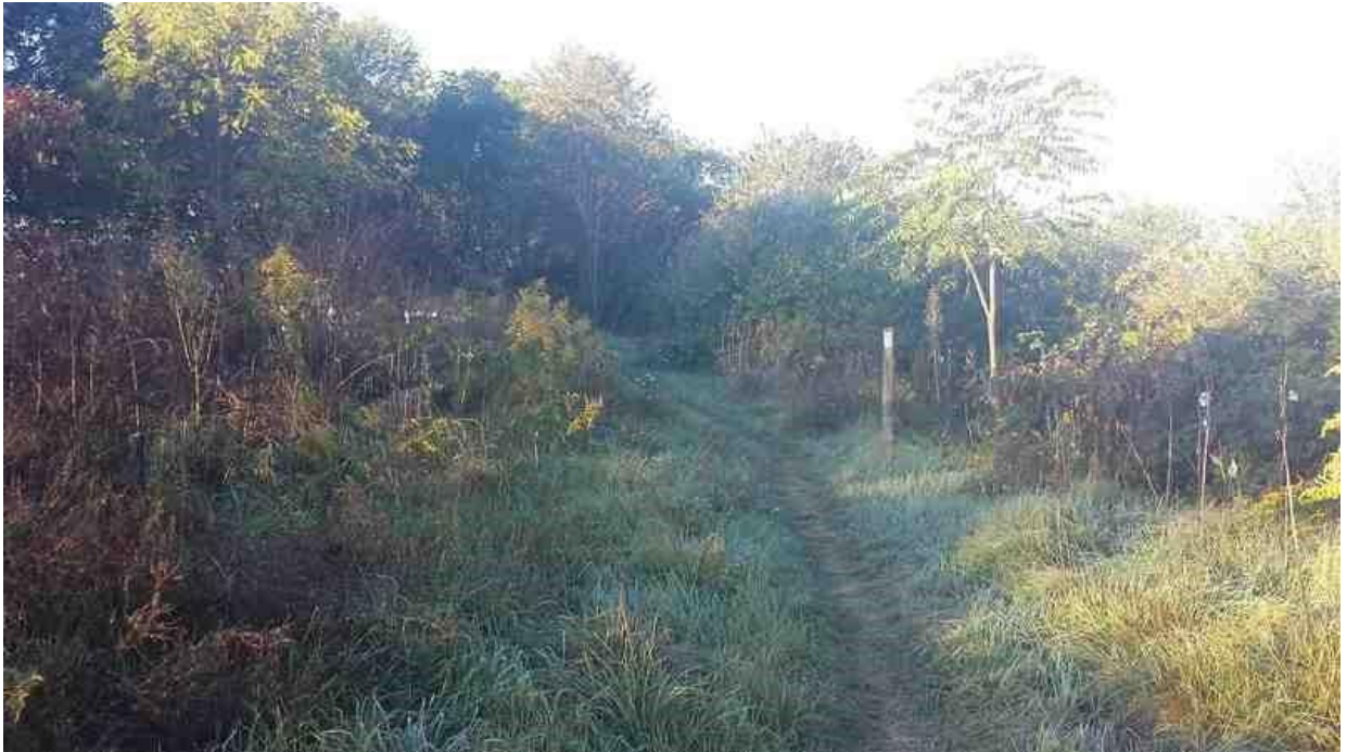
Photo: Day 167 Wow, we were super fast today! It was only 12 miles, but 800 meters in altitude and lots of rocks that would have to slow us down; but they did not....(2017-10-04 19:23)

I have much to sew and it's already Hiker's Midnight, so half past nine.