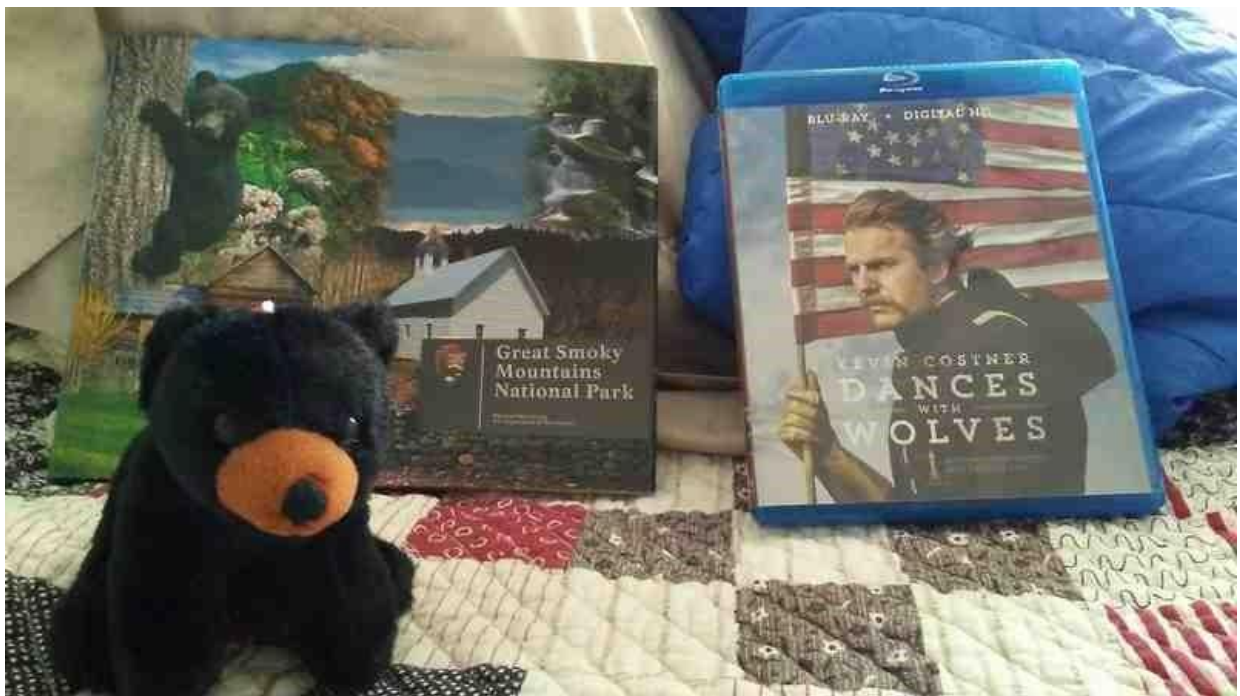
Photo: 11th December Hey, I had a very wonderful birthday with all the trimmings at first I did quite a lot ... (2017-12-12 13:40)