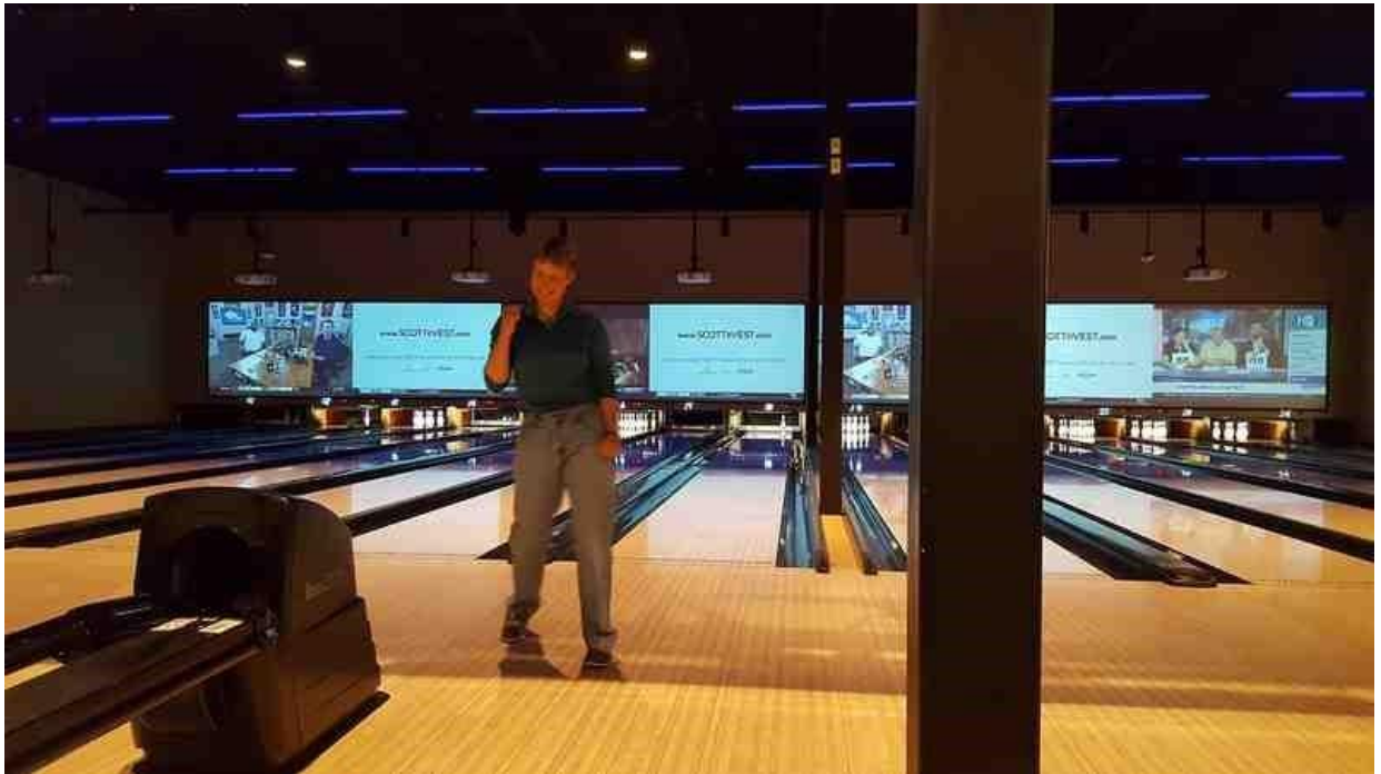
Photo: 6 December We were bowling yesterday Great fun! I usually hit in the right gutter, but have in between ...(2017-12-06 14:24)