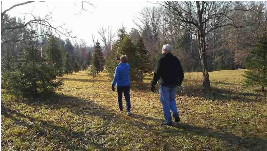
Photo: December 4, we were the day before yesterday on a farm for Christmas Trees. So you drive a good deal to the country, parked on a ...(2017-12-04 10:47)